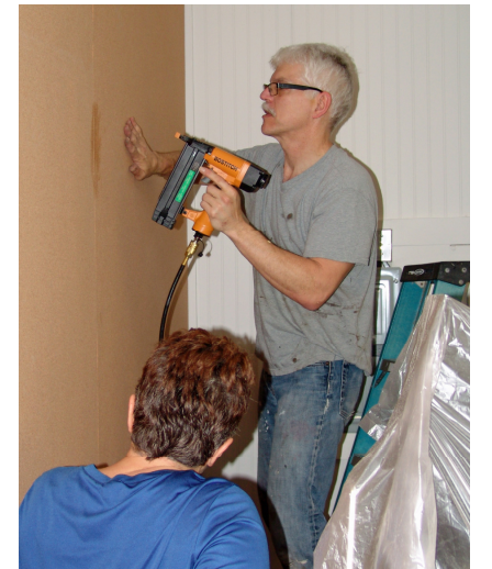
Left: The interior with renovation underway and most of the crew "out to lunch."