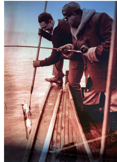
Lou Gehrig and Babe Ruth fishing on the Choptank River, circa 1930.